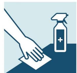
Keep objects and surfaces clean

Call your doctor again if you are getting worse. Call back if you are having trouble breathing. Do what your doctor says.