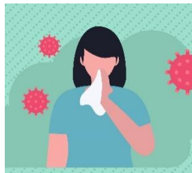
Use tissues, then throw them away